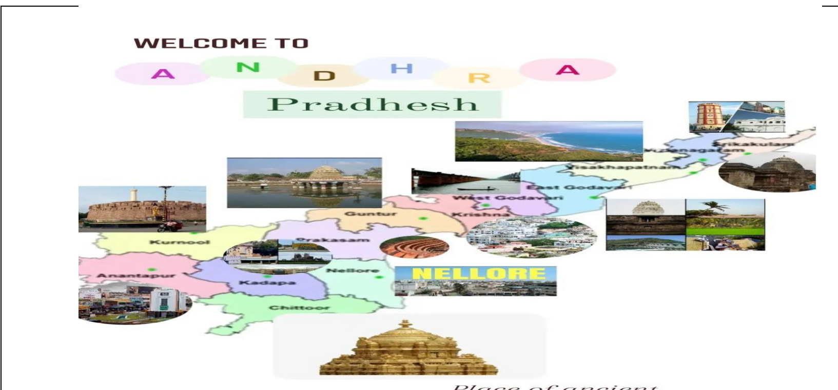
Place of ancient history ,present and glorious future